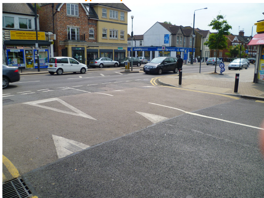
Typical Raised Entry Treatment

The details of the 20 mph zone proposals are shown on the enclosed plan for your information