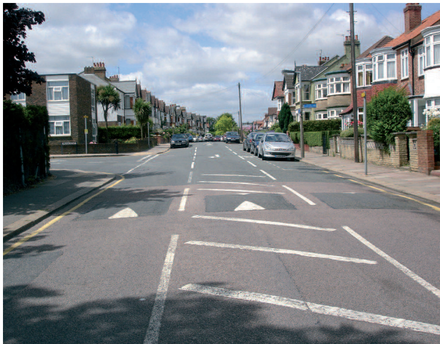
Typical Speed Cushions